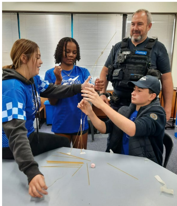
Morwell Blue EDGE