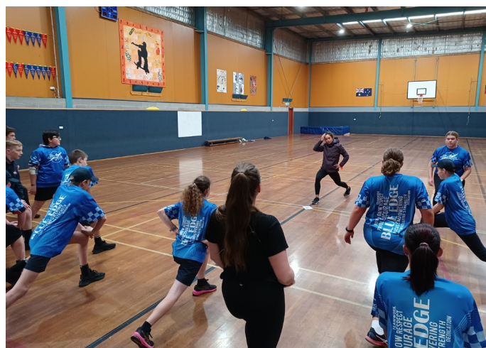
Wonthaggi Blue EDGE