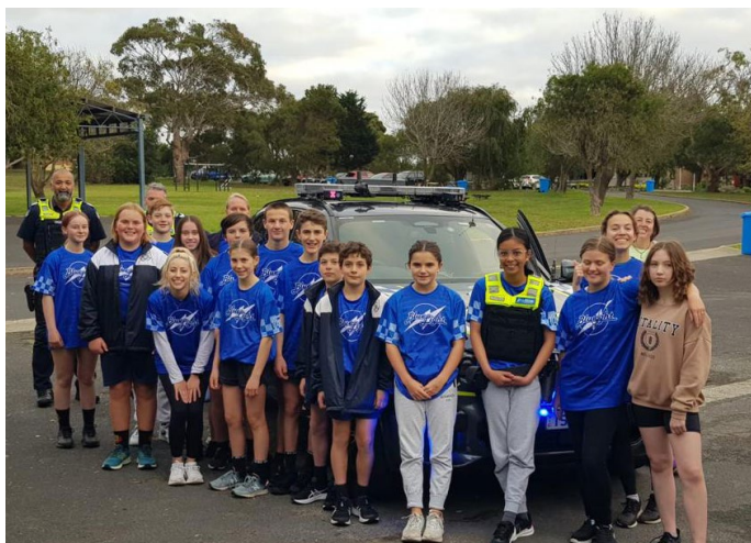
Portland Blue EDGE

It was so great to get more familiar with the program and meet the Blue Light Team and other facilitators. I left feeling like I was part of team and not a stand alone facilitator.