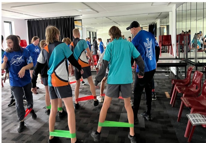
Shepparton Blue EDGE