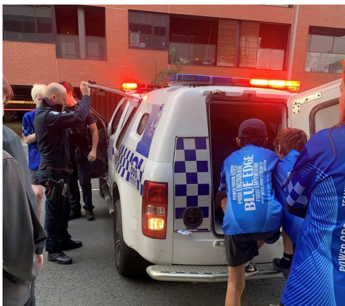
Richmond Blue EDGE