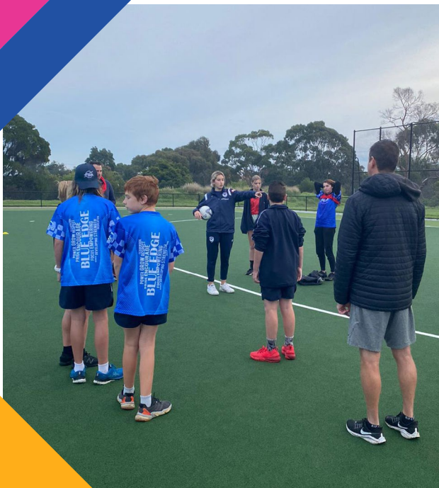
Frankston Blue EDGE

Thank you to MVFC for your support! We are extremely fortunate for your expertise and the positive impact your sessions have on the students.